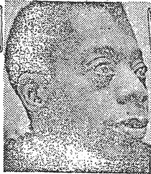
JAMES BALDWIN "It would be a disaster"

(Indicate page, name of newspaper, city and state.) THE EVENING NEWS LONDON, ENG. PAGE 4