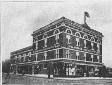
South Side Building