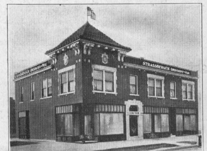
O'Fallon Park Building