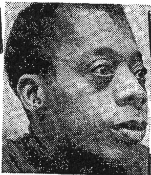
JAMES BALDWIN "It would be a disaster"

(Indicate page, name of newspaper, city and state.) THE EVENING NEWS LONDON, ENG. PAGE 4