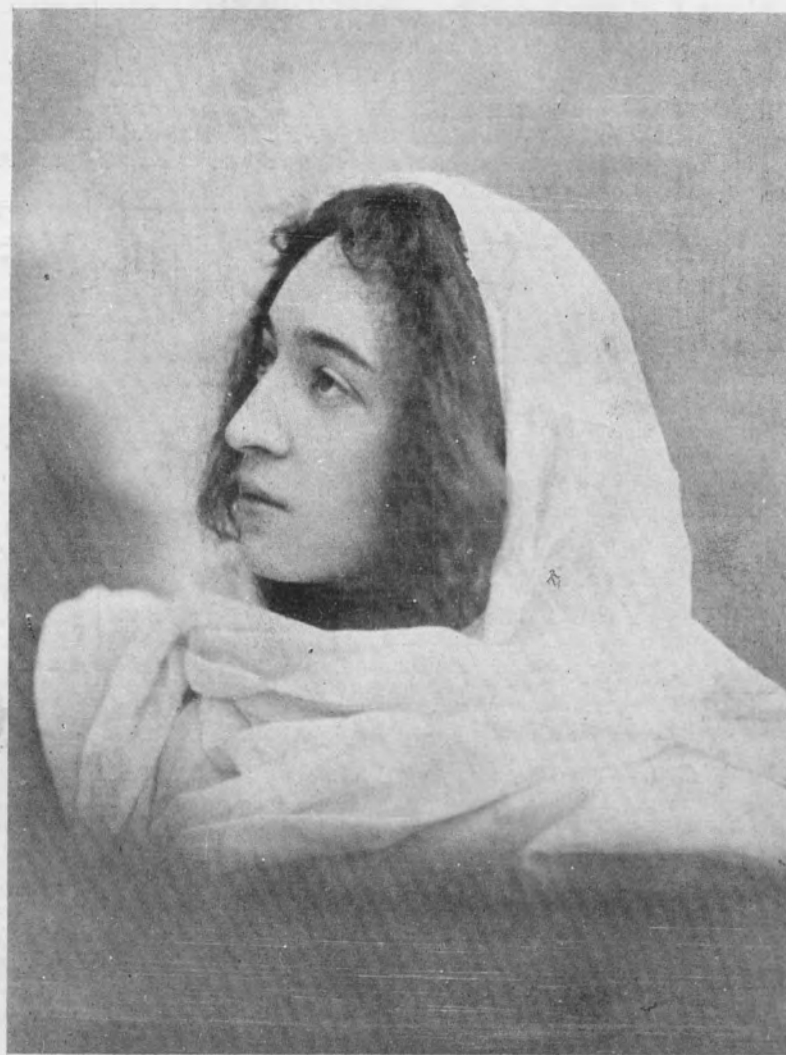
FANNIE BLOOMFIELD ZEISLER